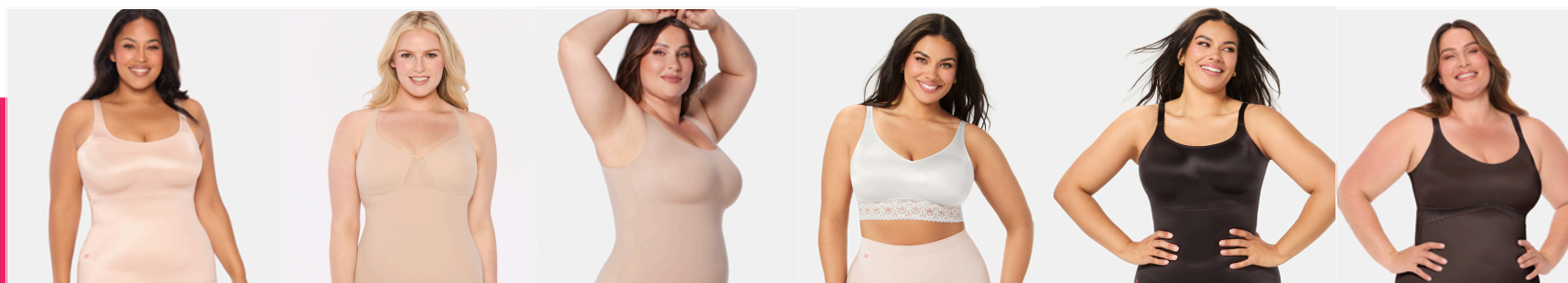
Original Cami Pale Size 34