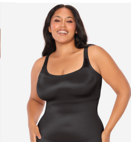
Original Cami Black Size 42